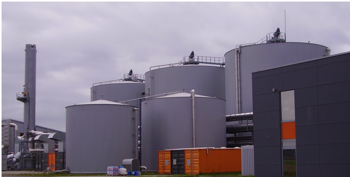
Photograph of anaerobic digesters at the Lübeck Waste Treatment Facility - a mechanical biological treatment plant